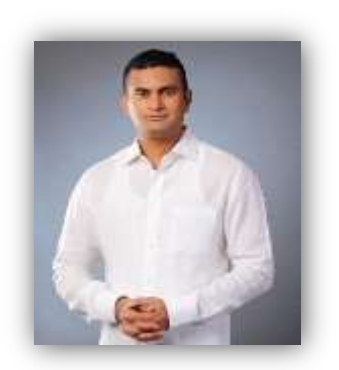
Hon'ble Shri Akshay Adhalrao Patil Secretary – SBSPM